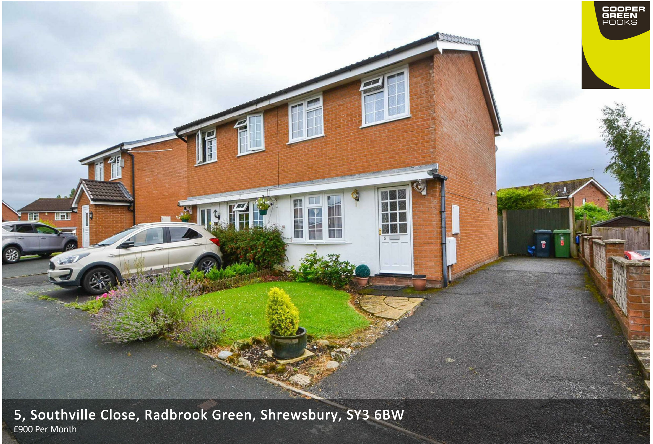
5, Southville Close, Radbrook Green, Shrewsbury, SY3 6BW £900 Per Month